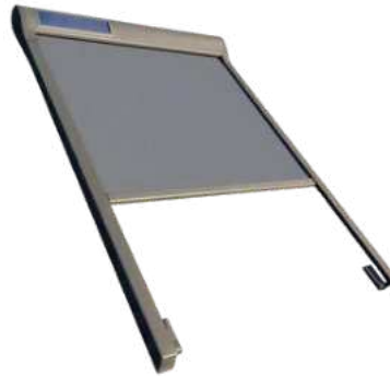
External textile screens