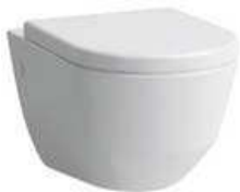
Toilet Laufen, Pro