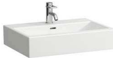
Washbasin Laufen Living City, white, B60/80/100 cm x T46 cm