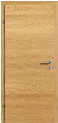
Front entrance door**