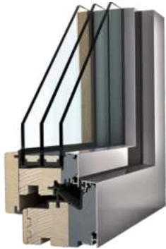
Triple-glazed wood/aluminium windows