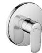
Bath mixer HansGrohe, Vernis