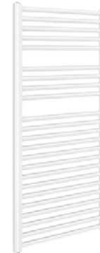
electric towel radiator Alva, Una 1., weiß ca. B60 cm x H175 cm