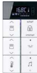
LS 990 | KNX Kompakt- Room controller F 40