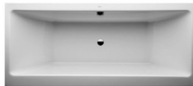
Bathtub Laufen, Pro, white, B80 cm x L180 cm