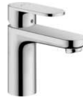
HansGrohe single-lever mixer, Vernis Blend, chrome finish