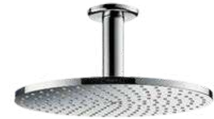
Rainshower HansGrohe, Raindance S