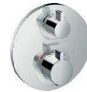
Shower thermostat HansGrohe, Ecostat S