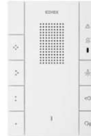
Intercom Voxie 2F+ 7-Taster white