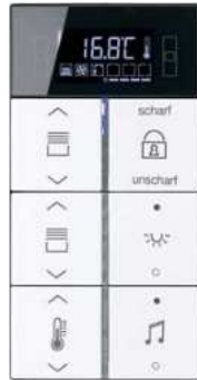
LS 990 | KNX Kompakt-Roomcontroller F 40