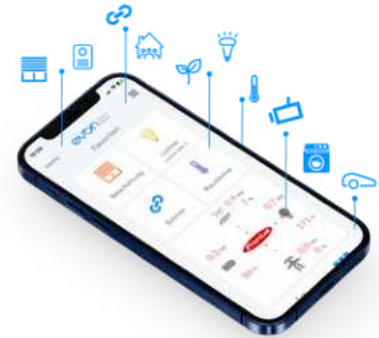
Smart home system from Evon