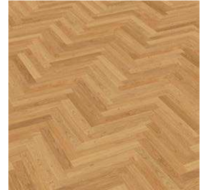
Oak herringbone parquet