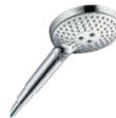
Hand shower HansGrohe, Raindance Select S120