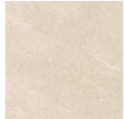
Tiles in Monterey